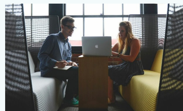
Team Photos Gallery >

Group all of your media assets together so that journalists can download your files easily. Use a file sharing service like Dropbox or Box to group all of your files. Then add the link above.