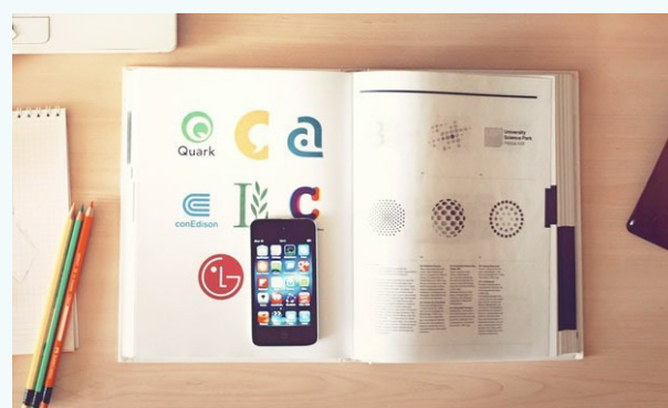
Logos and Screenshots Gallery >

Group all of your media assets together so that journalists can download your files easily. Use a file sharing service like Dropbox or Box to group all of your files. Then add the link above.